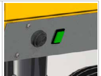
Service indicator (buzzer)